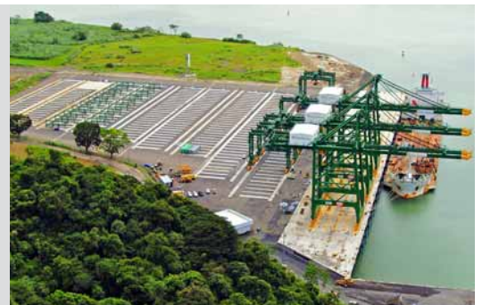
PSA PANAMA INTERNATIONAL TERMINAL

SOUTHEAST ASIA MIDDLE EAST SOUTH ASIA NORTHEAST ASIA EUROPE & MEDITERRANEAN AMERICAS PANAMA